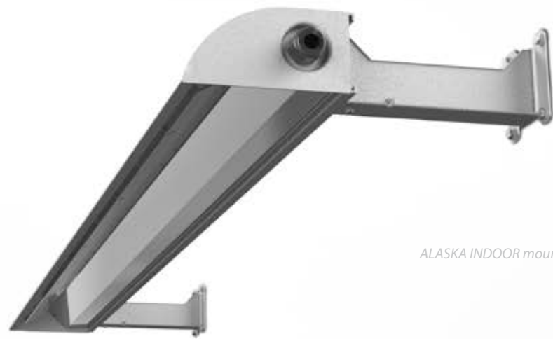
ALASKA INDOOR mounted on fixed wall fixing arm...