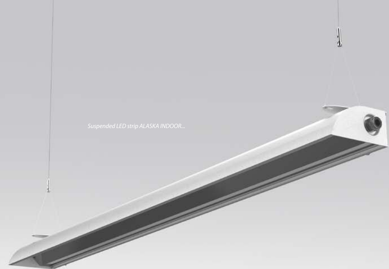
Suspended LED strip ALASKA INDOOR...