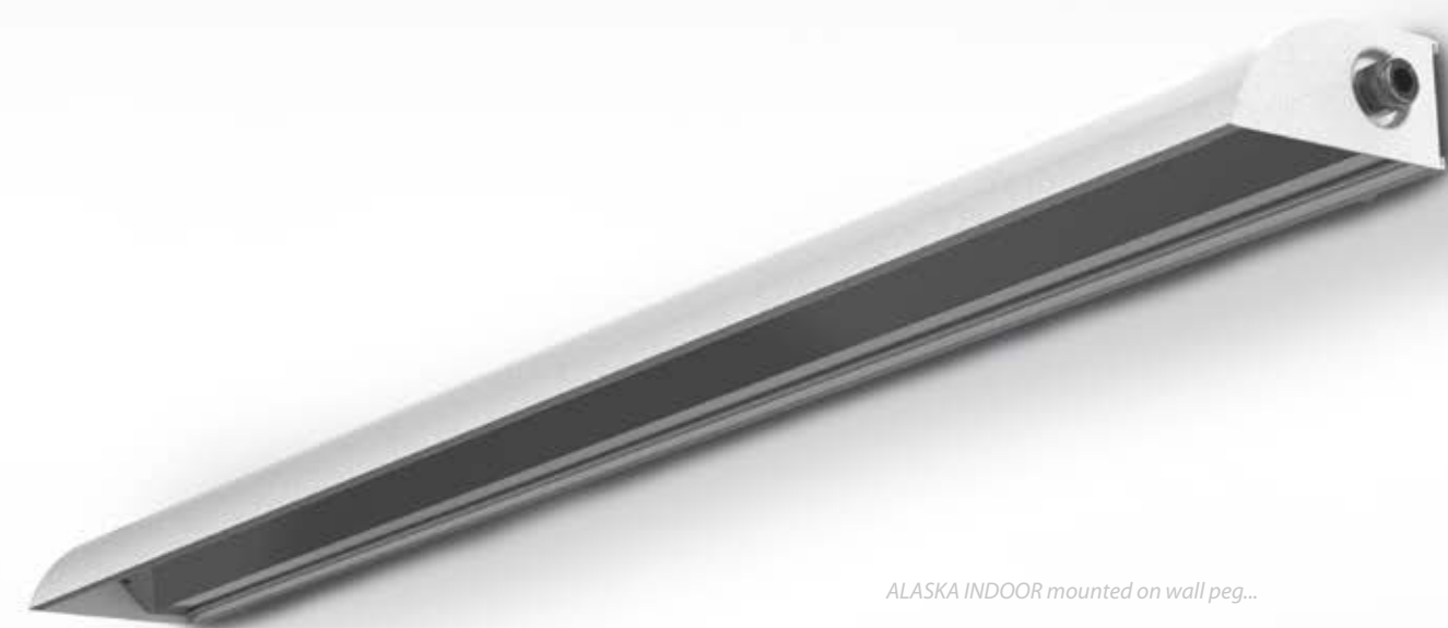
ALASKA INDOOR mounted on wall peg...