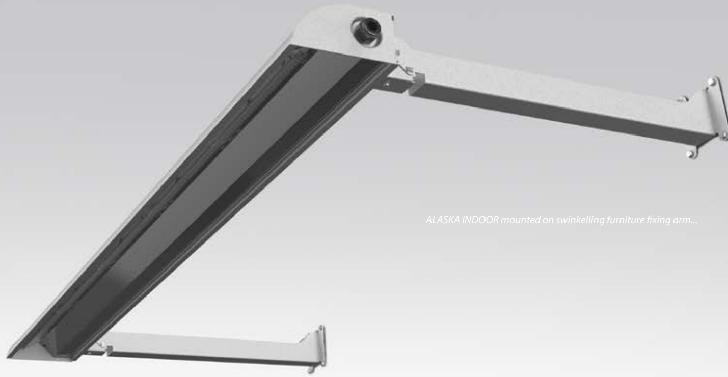
ALASKA INDOOR mounted on swivelling furniture fixing arm...